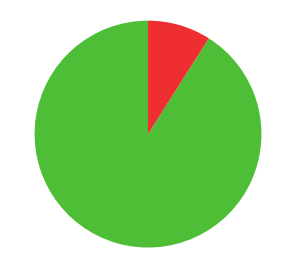
9.1 AVERAGE ARROW (TWO YEAR PERIOD)