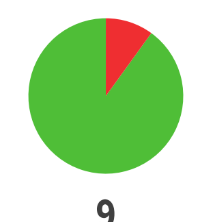
AVERAGE ARROW (TWO YEAR PERIOD)