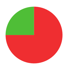
1/4 (25%) MATCH WINS