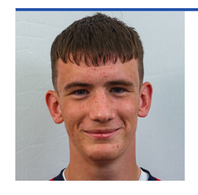
EDWARD GRAY GREAT BRITAIN