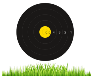
Target perpendicular to peg.

Field archery targets should be perpendicular to the pegs (at a right angle), allowing the full circle of the face to be visible to the athlete when shooting. When building the course, ensure targets on an up- or downhill are angled appropriately. This prevents damage to arrows when they hit the targets at an angle as well as being in the spirit of the competition.