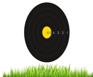
Unacceptable target at an angle to peg.