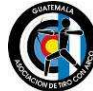
World Ranking Event 30 April-7 May 2008