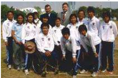
FITA President and SG with Thai National Team