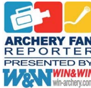
Official Presenter of the Archery Fan Reporters