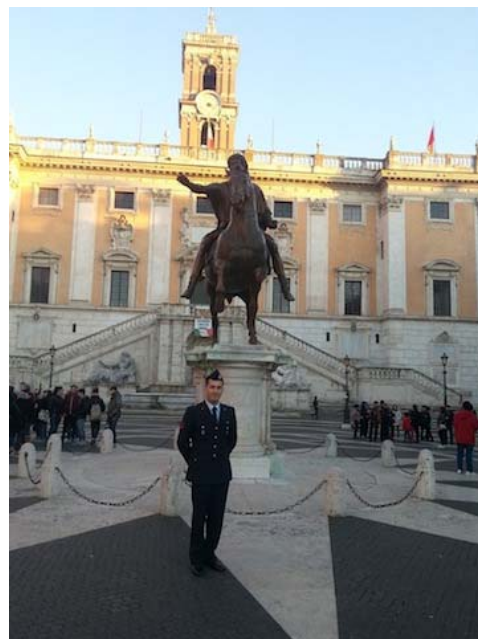
In front of the City Hall and statue of emperor Marcus Aurelius