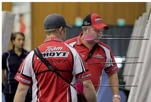
The WILDE brothers

In recurve women, Celine BEZAULT (FRA) defeated her compatriot, 2008 Olympic team bronze medallist Berengere SCHUH in a shoot-off for first place. Victoriya BELOSLYUNTSEVA (KAZ) finished third.