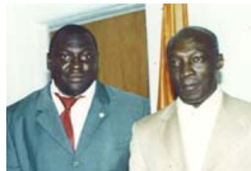
The President of the Ivory Coast Archery Federation and Ivory Coast's Sports Minister (from left to right).

Not for now, because of material means and financial problems. Besides, since the 2002 clash our government tends to think of bows and arrows as weapons, and they view unfavourably the organisation of archery events. However, our hopes are strong that next year we will be able to organize a National Championships for seniors, juniors and cadets.