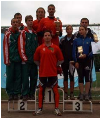
The Team Event podium