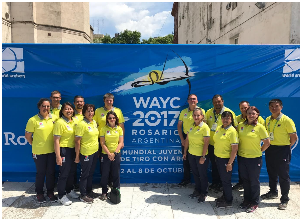
World Archery Youth Championships in Rosario, Argentina