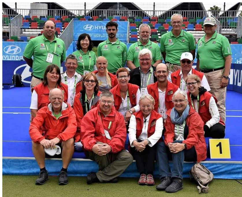
Hyundai World Cup Stage 4, Berlin