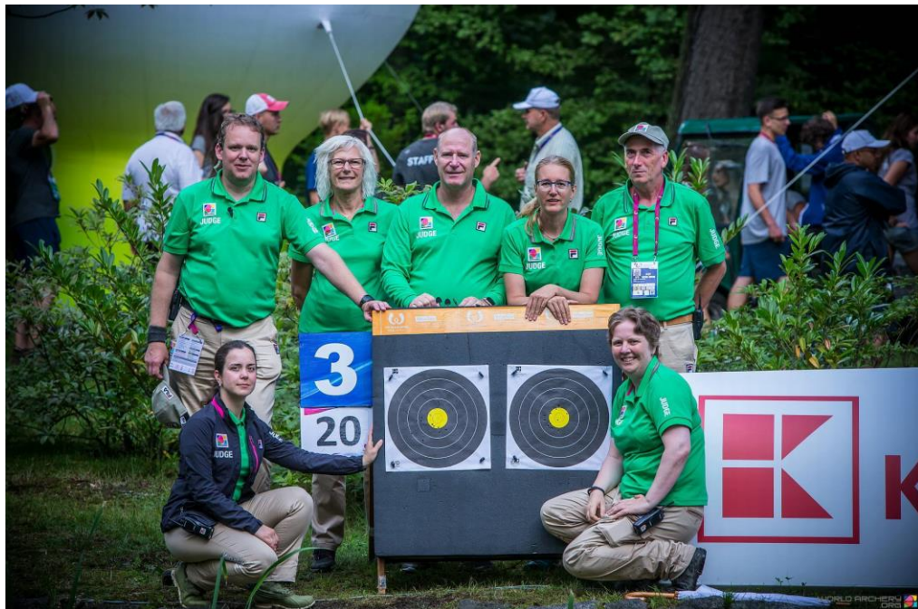
World Games, Wrocław, Poland