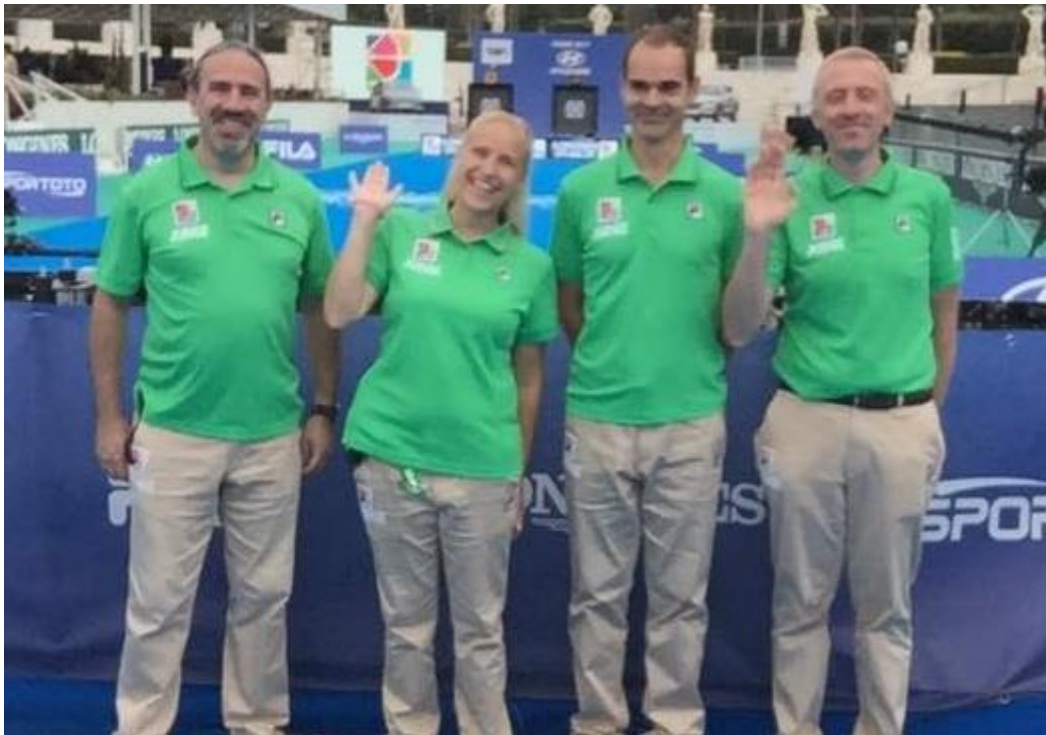
Hyundai World Cup Finals, Rome