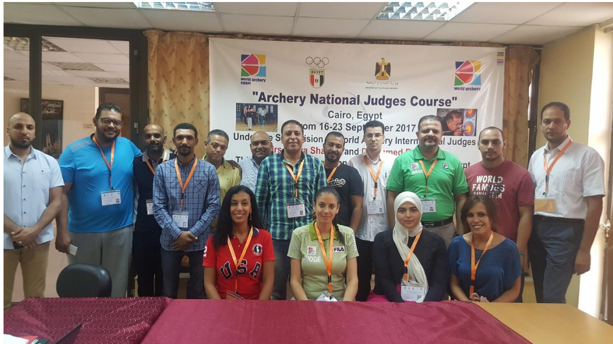
Participants in the seminar in Cairo