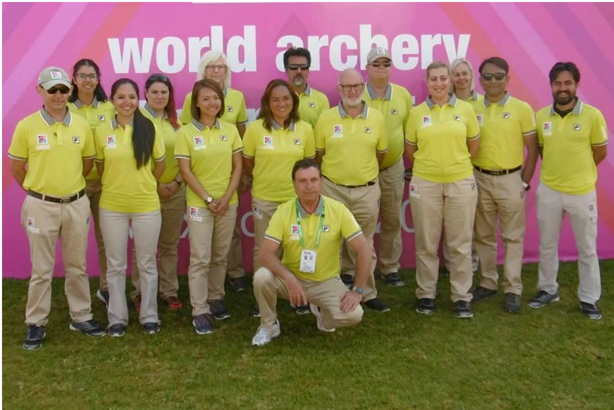
Hyundai World Championships, Mexico City