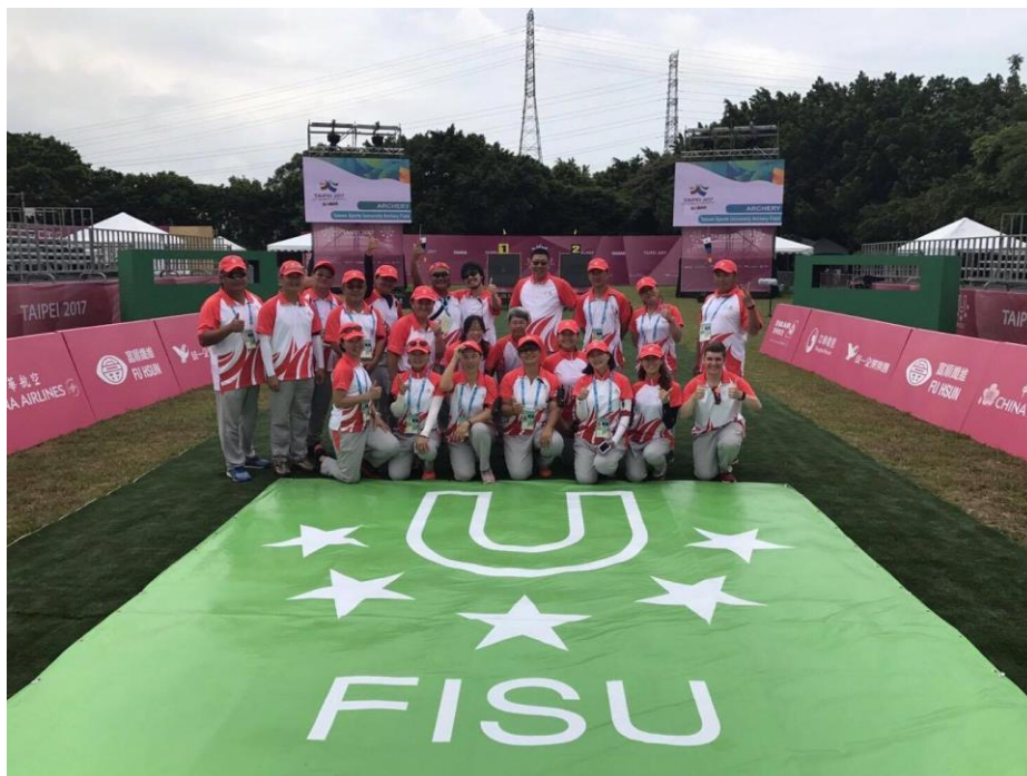
Summer Universiade, Taipei